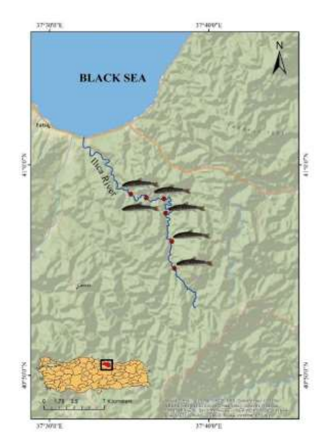
Figure 1. Overview map and sampling stations on the Ilica River

At least 10 fish specimens were taken from each species caught in six stations between April-May, September-October in 2014 and 2015. The taxonomic classification of fish species was done in agreement with the descriptions of Van Der Laan et al. (2014), Nelson et al. (2016), Eschmeyer and Fong (2017), and GBIF (2017).